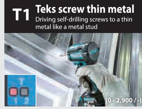
The tool stops rotating soon after impact starts.