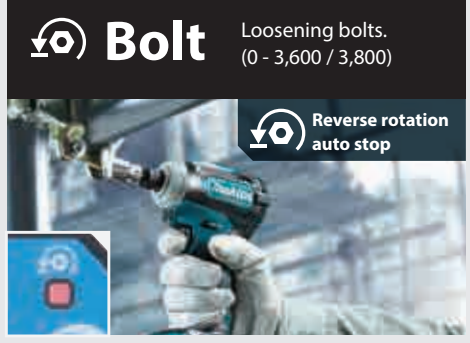
This mode helps to prevent a bolt from falling off.