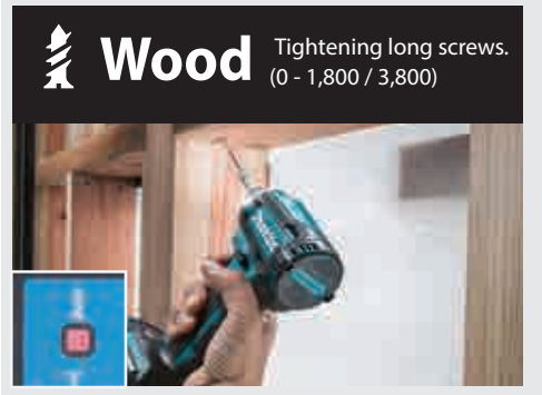
The tool drives a screw with low-speed rotation at first. After starting to impact, the rotation speed increases and reaches max speed.